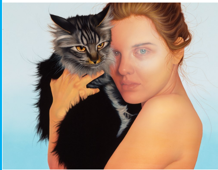
Other example of her artwork