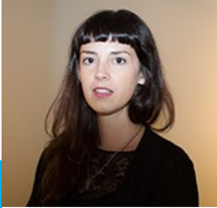
Picture of the artist