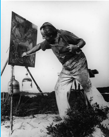
Picture of the artist painting outside