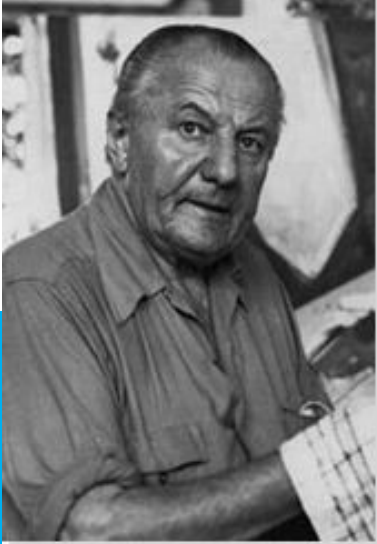
Picture of the artist