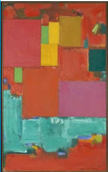
Another example of his artwork